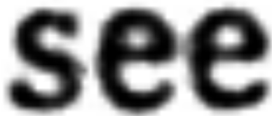
Figure 2a Actual image from a large, $250, 6.6MP image sensor with large, 3.5um x 3.5um pixels

The best way to illustrate this concept is with visible examples of the difference between ‘large pixel’ and ‘small pixel’ sensors. Figures 2a and 2b are enlarged image detail at the exact same magnification, of the exact same text on 35mm microfilm. Figure 2a was captured with a large, $250, 6.6MP image sensor with large pixels. Figure 2b was captured with a small, $50, 18MP sensor with small pixels. It is very easy to see that the image from the 6.6MP sensor is substantially clearer than the image from the 18MP sensor.