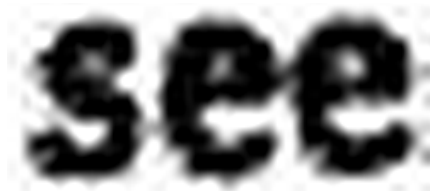
Figure 2b Actual image from a small, $50, 18MP image sensor with small, 1.25um x 1.25um pixels

The conclusion is as clear as the image in Figure 2a! When choosing a microfilm scanner, don't be enticed by higher megapixel counts. Rather, for best image clarity, choose a scanner with a physically large image sensor with large pixels. Microfilm scanners like e-ImageData's ScanPro® devices employ a large 6.6MP sensor with large 3.5um x 3.5um pixels, almost 8 times greater pixel area than the 18MP sensor of its competitors.